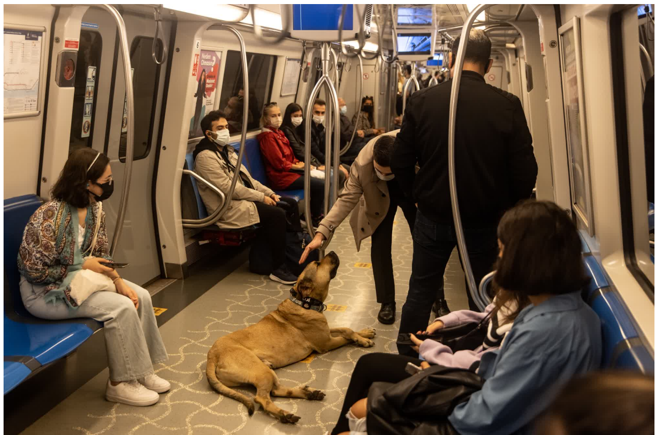
10. End point - conclusion of the action