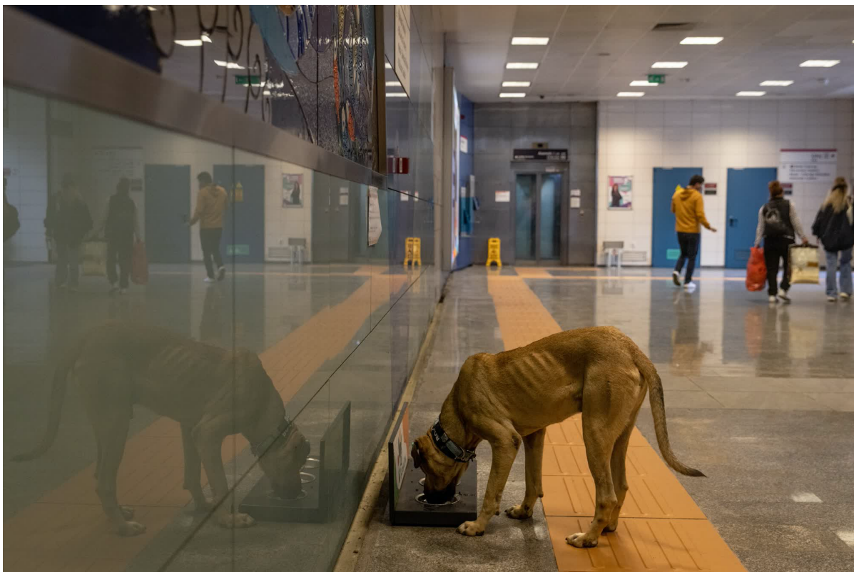
6. Close-up - detail of the action