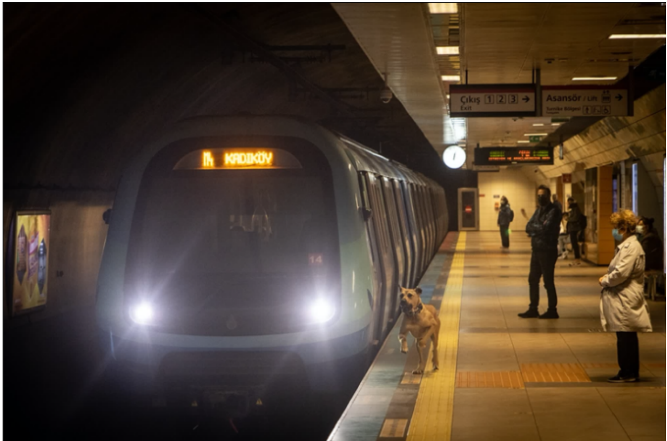
9. Continuing action – different camera angle and composition