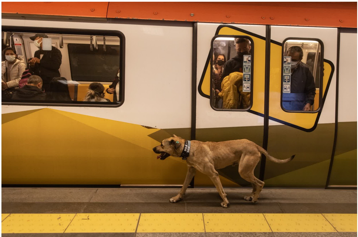
2. Medium shot - establish the topic