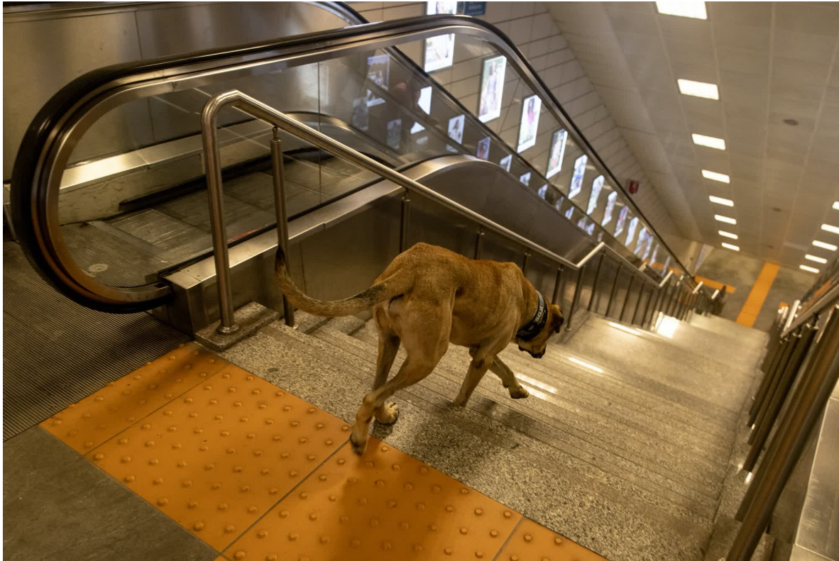
5. Continuing action - different camera angle and composition