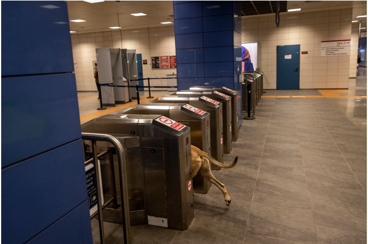
7. Continuing action - different camera angle and composition