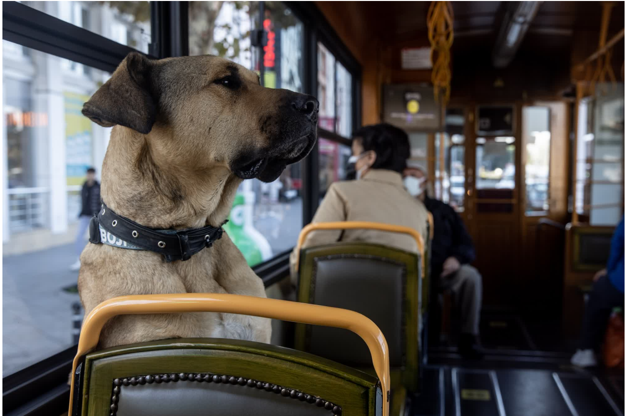
3. Portrait - introduce the characters