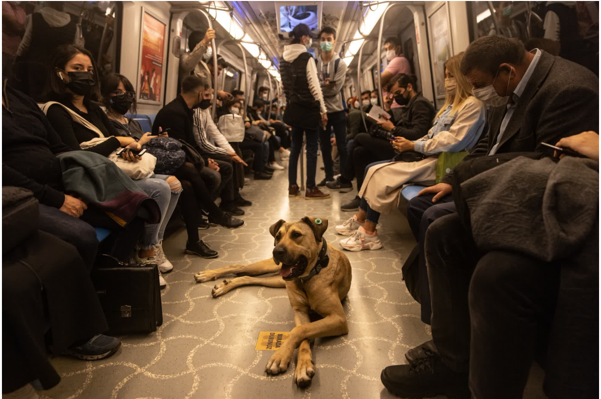
1. Scene setter - establish the location